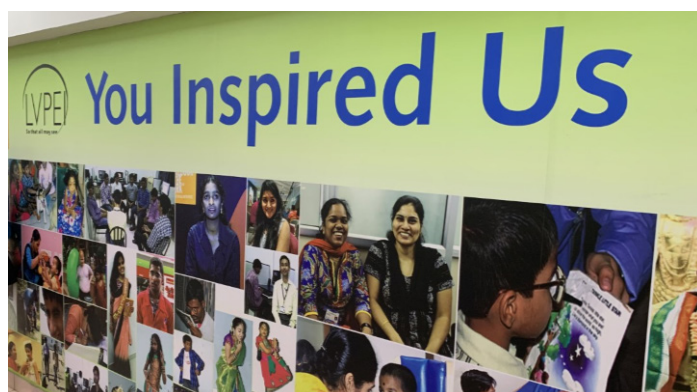
Below: A mural at LVPEI honors the thousands of patients treated at this world-renowned facility.