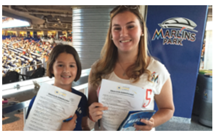
Donor family members test their skills while playing the Marlins Park Scavenger Hunt.