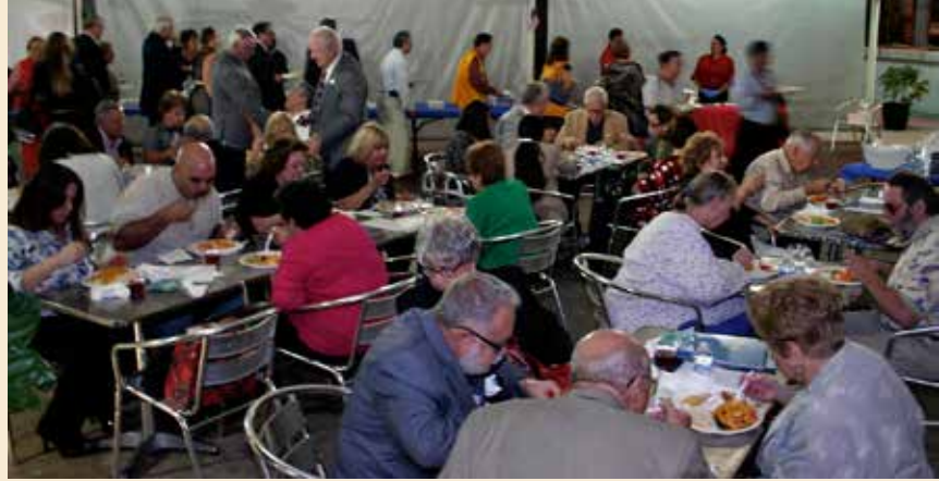
Lions and guests end the evening with a festive paella dinner at the Bascom Palmer Eye Institute patio.