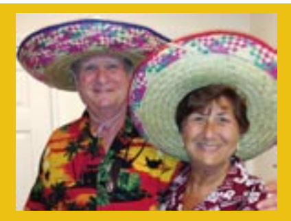
Lions Events-Page 3

$40 Per Ticket • Please call (305) 326-6359 by May 29th